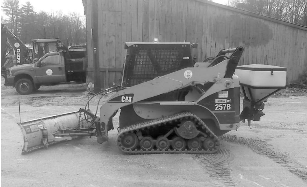
Skid Steere outfitted with donated plow and new sander

2012 Started off with the road crew cutting brush on Fortune Road between plowing and sanding roads. The crew hauled 1,000 yards of \frac{3}{4} crushed gravel from Mt. William in Weare, with money reimbursed from FEMA. The crew screened winter sand and patched potholes.