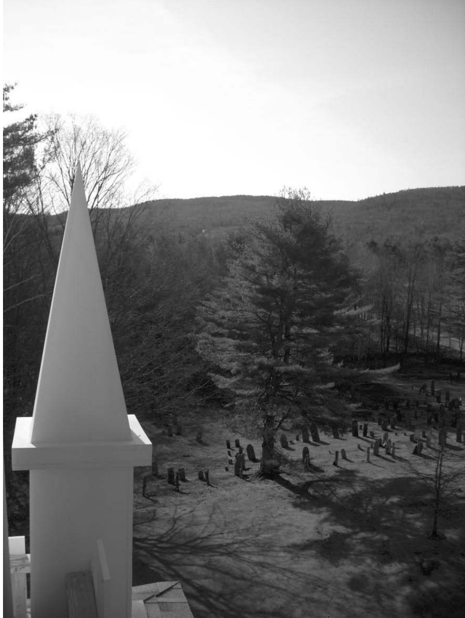
Bradford Meeting House, Bradford Center