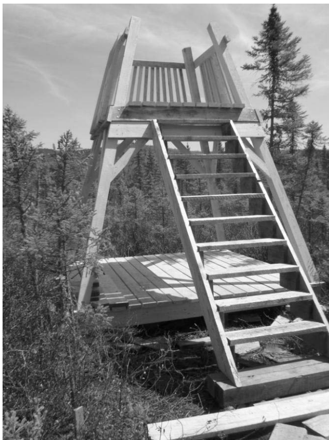
Bog Observation Tower – Bradford Bog

In 2012, the Ausbon Sargent Land Preservation Trust celebrated its 25 th anniversary as a leader in the conservation of our natural resources in the Mount Kearsarge/Lake Sunapee Region. The mission of this non-profit, citizen-based group is to protect the region's rural landscape. Land conservation is a partnership that often involves not only the landowner and Ausbon Sargent, but also other conservation organizations and local conservation commissions.